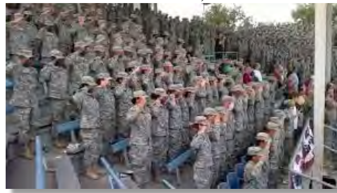
Trainees at Fort Jackson

Our state has the nation’s 10 th highest number of Department of Defense (DoD) personnel and the 9 th highest number of military retirees. Installations include Fort Jackson, Shaw Air Force Base, Joint Base Charleston, U.S. Coast Guard, Marine Corps Air Station Beaufort, Marine Corps Recruit Depot Parris Island, Naval Hospital Beaufort, and McEntire Joint Base. Statewide, the military community includes the SC National Guard, the Army and Air Force Reserve of South Carolina, the Army Corps of Engineers, and the National Nuclear Security Administration at the Savannah River Site.