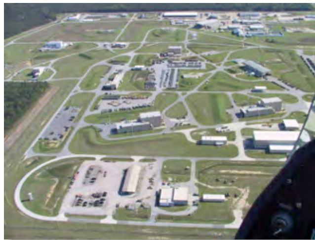
View of Naval Weapons Station, Charleston

To host communities, the presence of the military has an even higher impact. A military installation, whether it is a joint base such as Charleston or a National Guard armory in a rural community, brings jobs and people. The value of a base is as significant