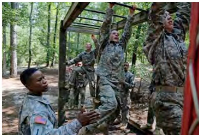
Trainees at Fort Jackson