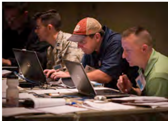
SPAWAR's 5th Annual Cyber Defense Competition