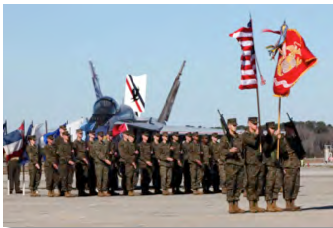
Change of Command at MCAS Beaufort