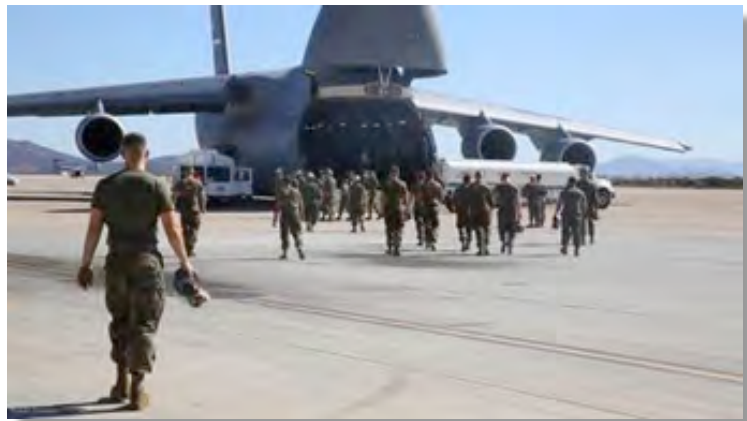
Soldiers loading a C-17 at Charleston AFB

South Carolina has many opportunities to expand state support for the active duty military, retirees and their families. The quality of life for military families lightens the administrative load to enable the military to focus on its mission. Quality of life in military communities is a national issue confronting every base, and a significant factor considered by military personnel when faced with a choice in duty locations or where they choose to retire.