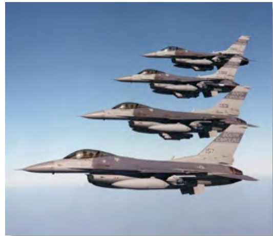
F-16s from McEntire Joint Guard Base

An objective body is necessary to administer dedicated resources for defense communities, veterans and retiree support. The links between veterans/retirees and bases are inextricable because most services offered are located on the bases. Cross-cabinet support is necessary to coordinate initiatives to enhance installations and improve the military quality of life. Mitigating the concerns expressed by the military regarding operations and qualities of life will require actions by federal, state agencies, and local government collaboration. Many states, such as North Carolina, have instituted cabinet-level military departments to address these issues.