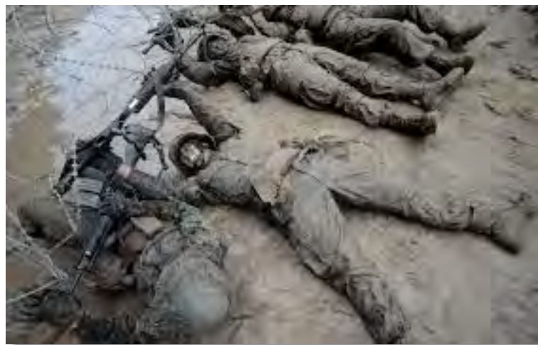
Training at Parris Island Marine Recruit Depot