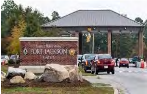
Gate at Fort Jackson

2) Identify each service's mission requirements and proactively create favorable conditions for future basing decisions in South Carolina. The MBTF must join in advocating for new missions identified by the bases and DoD. See individual base recommendations for specific mission targets and strategies,