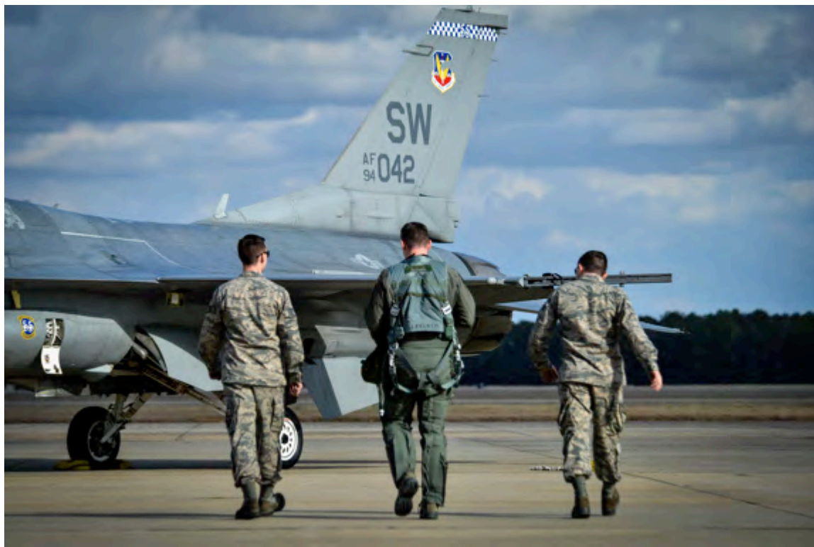
Airmen at Shaw AFB prepare to deploy to Middle East

There are over 750 defense contractors located within South Carolina. These contractors support military installations located inside and outside South Carolina, executing $2.1 billion in defense contracts within the state.