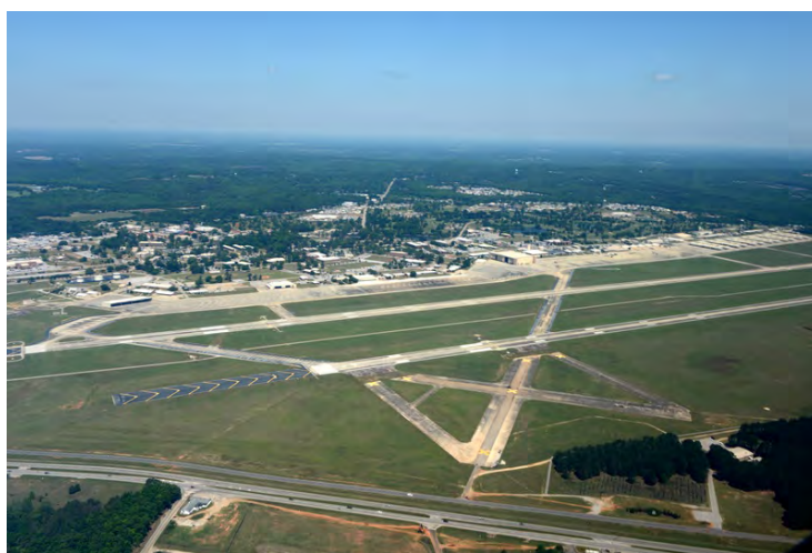
Aerial View of Shaw Air Force Base

The state and local communities must be keenly aware of existing and potential encroachments to each of our installations. These include property development restrictions, noise impacts to residential areas, flight zones, and environmental impacts. The DoD considers many factors 5 when evaluating an installation for compatible use and identification of encroachments. The state must understand these concerns and work to overcome any threats to military operations and mission impairment.