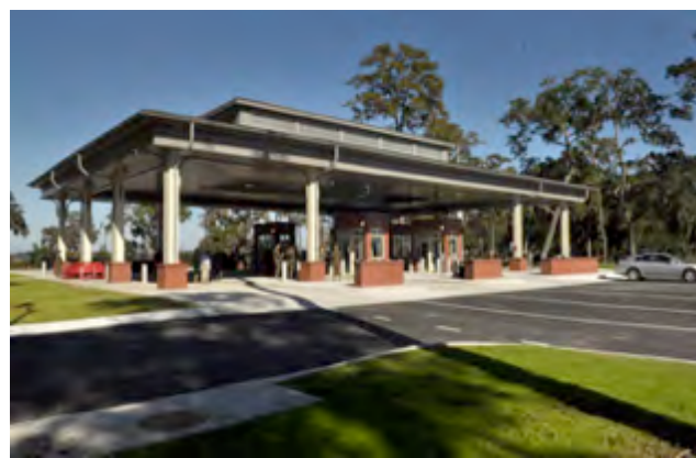
New Gate at Parris Island Marine Recruit Depot