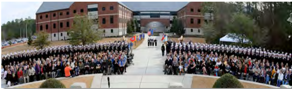
Above: MRAP at Joint Base Charleston. Below: Graduation at Navy Nuclear Power School.

Committee (VPAC) that will evaluate options to improve veterans and military retiree support services.