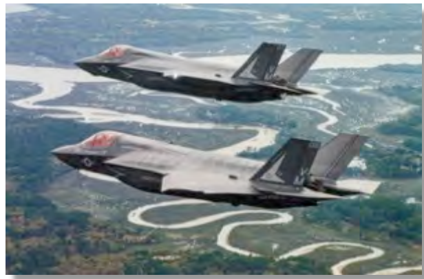
F-35s fly over Beaufort SC

South Carolina's commitment to supporting our military is evident nationally. For example, the Association of Defense Communities (ADC) recognized the Charleston Region as one of eight Great American Defense Communities in 2017. The Base Commander of Joint Base Charleston also received the ADC Military Leadership Award. Charleston's family support during deployment, housing, education, job opportunities, and appreciation of the military presence is exemplary but not unique in our state.