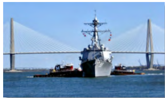
US Navy ship entering Charleston Harbor